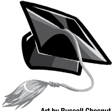
Art by Russell Chesnut