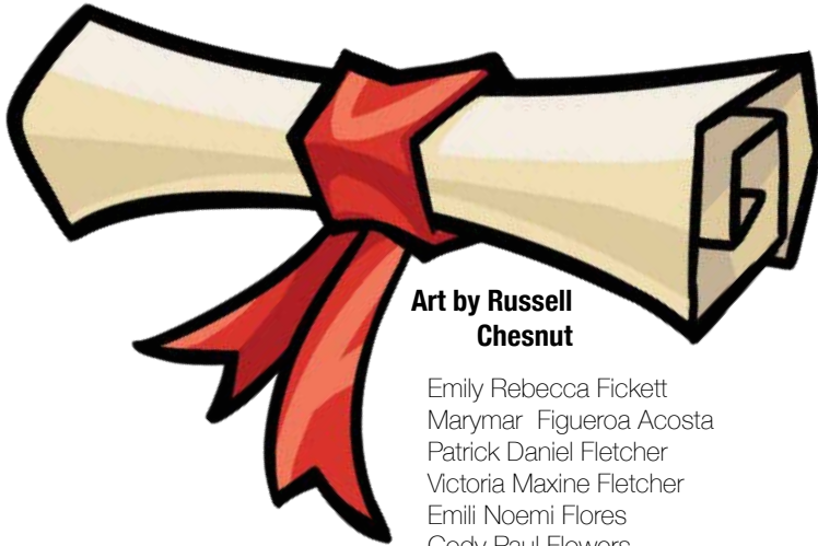
Art by Russell Chesnut